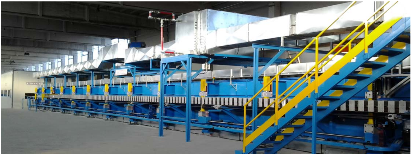
Example of equipment sold to one of the most important manufacturer in Europe

Reassuring the Cannon wet and dry technologies “state of the art”, the Compact 1200 HT , with its innovative solutions leading to a high efficiency system, allows above all low start-up scraps and idle times high reduction improving the overall productivity of the line.